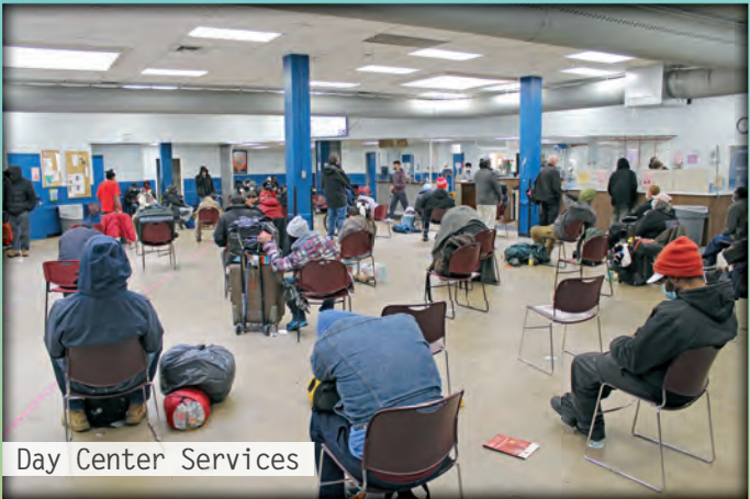
Day Center Services