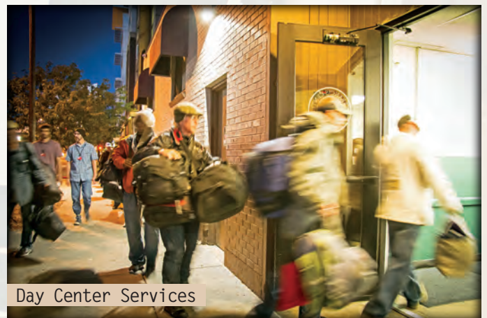
Day Center Services